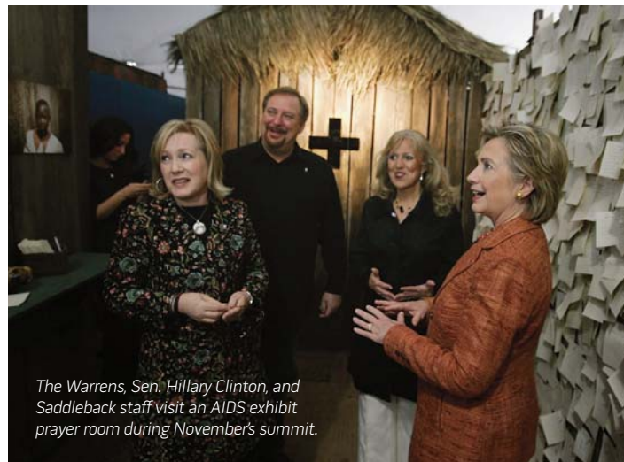
The Warrens, Sen. Hillary Clinton, and Saddleback staff visit an AIDS exhibit prayer room during November's summit.

and to receive the love of relationship in the church."