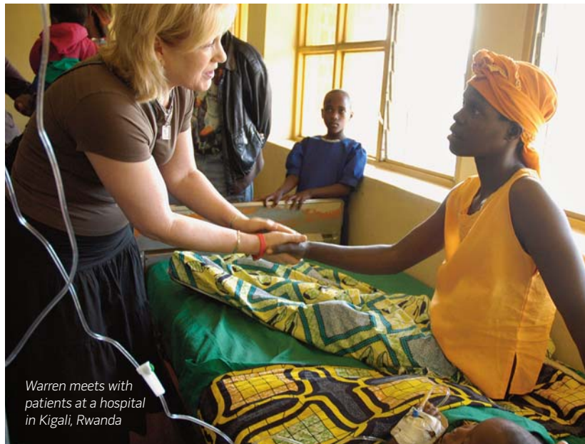
Warren meets with patients at a hospital in Kigali, Rwanda

A small number of detractors have also focused on the Warrens' willingness to invite abortion rights supporters—Sen. Barack Obama in 2006 and Sen. Hillary Clinton in 2007—to participate in the AIDS summit. The Warrens, who avoid partisan politics, had invited every presidential candidate.